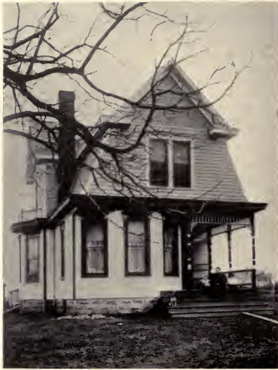
WEST HOME. Kimmudy, Illinois.